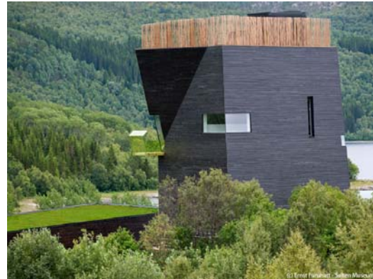
Knut Hamsun Center